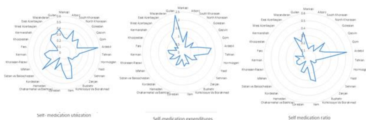
Figure 1. self-medication expenditures, self-medication utilization and self-medication ratio in provinces of Iran.