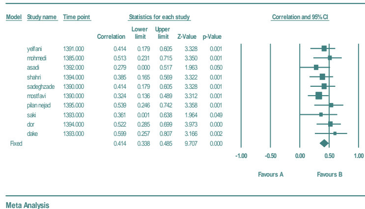
Table 3. Study results of the beck and Mesomorphic Rank correlation method