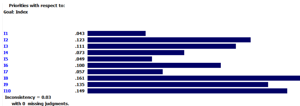
Figure 1. Displaying the weight and priority of treatment driving indices

indices was 0.03. Given that the inconsistency rate should be less than 0.1 (13), the obtained weights and priorities were acceptable and there was an acceptable consistency between the opinions of the samples (Figure 1).