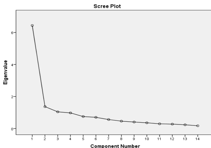
Figure 1. Scree Plot eigenvalues obtained from factors analysis

factors. Moreover, the output of the Scree Plot displayed that eigenvalue changes were minimized from the factor three onwards. Thus, these three factors could be extracted as the most noticeable ones explaining the variance of the data (Figure 1).